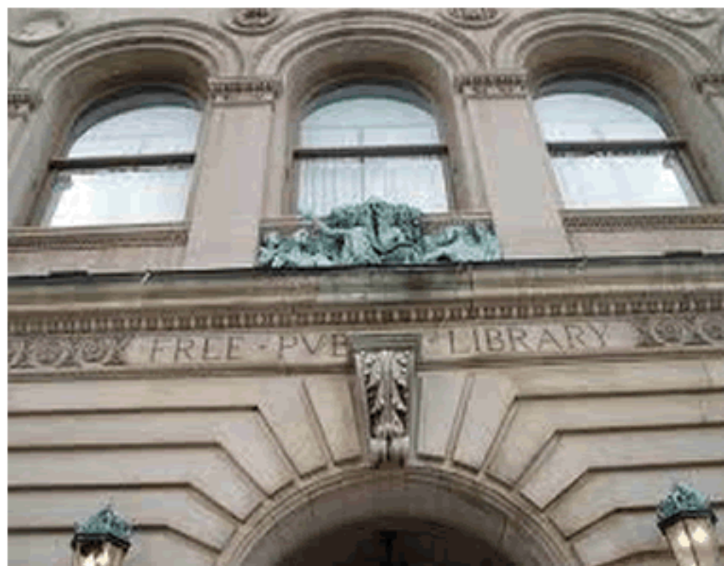
MAIN LIBRARY, 5 WASHINGTON STREET

Booked for the Evening allows the Library to raise much needed revenues for its Annual Fund — the Fund that enables the Library to continue offering excellent programs and services — while recognizing those who have displayed a great commitment toward its vision and mission.